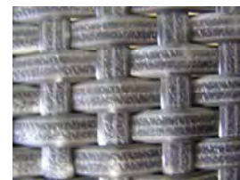
Dark Brown / Two Tone Finish

We are pleased to introduce our Sorrento rattan wicker series armchair which is designed for a more leisure seating environment due to its deeper seat. Light weight and easy to lift and move around, the Sorrento allows for a comfortable seating experience.