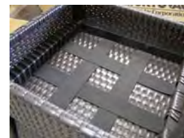
No Sag webbing